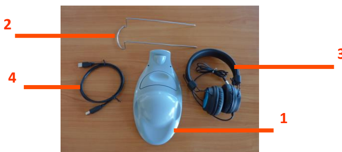
Figure 2 VisioClick® and accessories