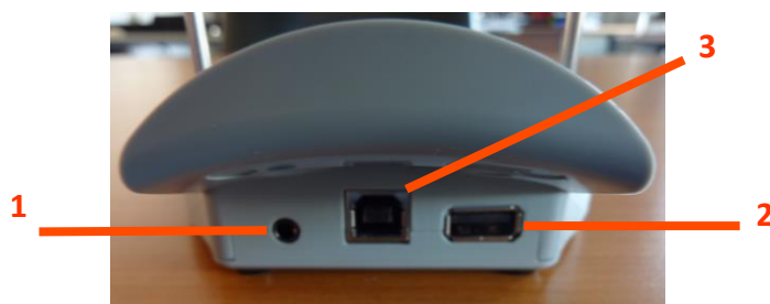
Figure 5 Rear side - Connector support