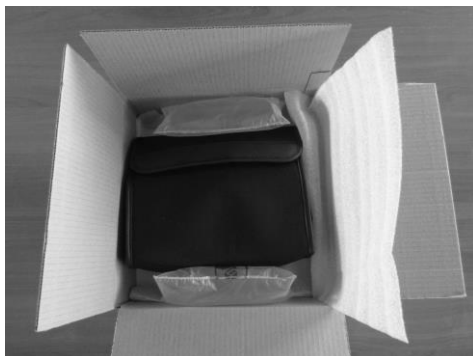
Figure 1 Opening the original VisioClick® packaging

We strongly recommend keeping the original VisioClick® packaging in its entirety for future maintenance.