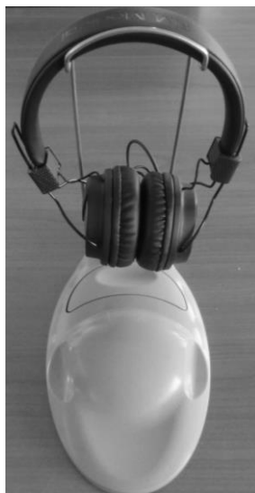
Figure 6 VisioClick® with headphones placed correctly onto the stand