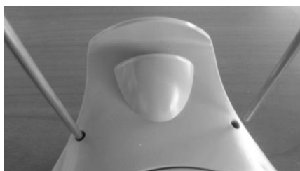
Figure 4 Installation of headphones stand